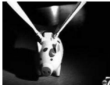
Video: Employee: Insurance Company Pays Claims 'When Pigs Fly'

But a Boulder jury said there was something wrong and handed down a $3