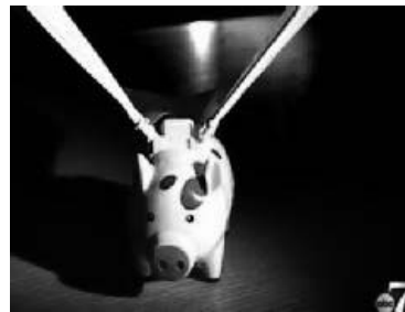
Video: Employee: Insurance Company Pays Claims 'When Pigs Fly'

But a Boulder jury said there was something wrong and handed down a $3